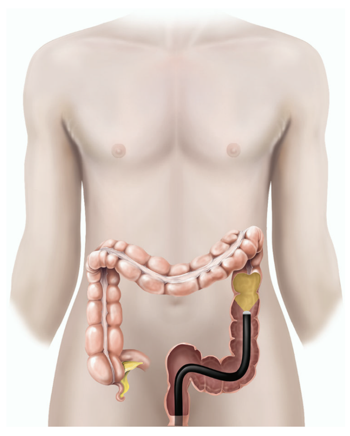
Sigmoidoscopy: a telescope is inserted into the large bowel via the back passage

An upper gastrointestinal (GI) endoscopy is a procedure to look at the inside of your oesophagus (gullet), stomach and duodenum using a flexible telescope. This procedure is sometimes known as a gastroscopy, OGD or simply an endoscopy.